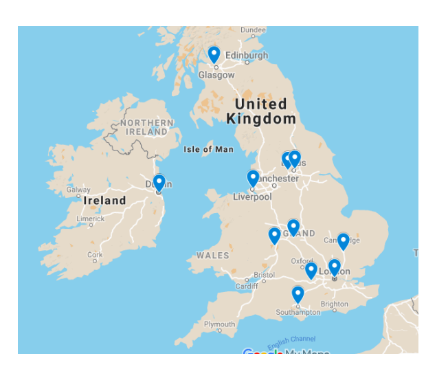
Interactive UK/Eire Proteomics Network map

3.1813819000000194&z=7. Ideally, we would like all proteomics laboratories in the UK and Ireland to input their details. To contribute, please send your group name, address, a brief description of the laboratory, three keywords and any links to h.whitwell@imperial.ac.uk.