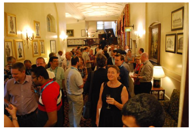
Reception at the Midland Hotel. Can you spot yourself?