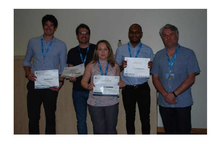
Congratulations and well done for the outstanding presentations!